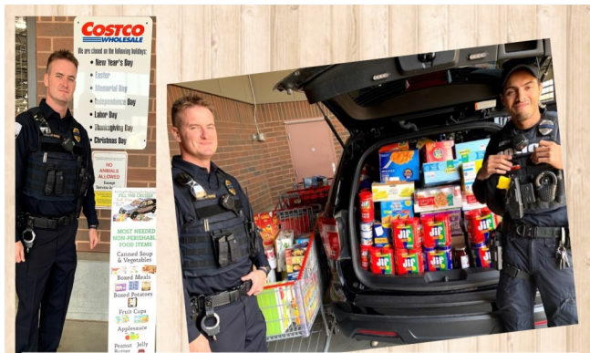
"Fill The Cruiser" by Boston Hts. Police Dept. at COSTCO 11/10/19